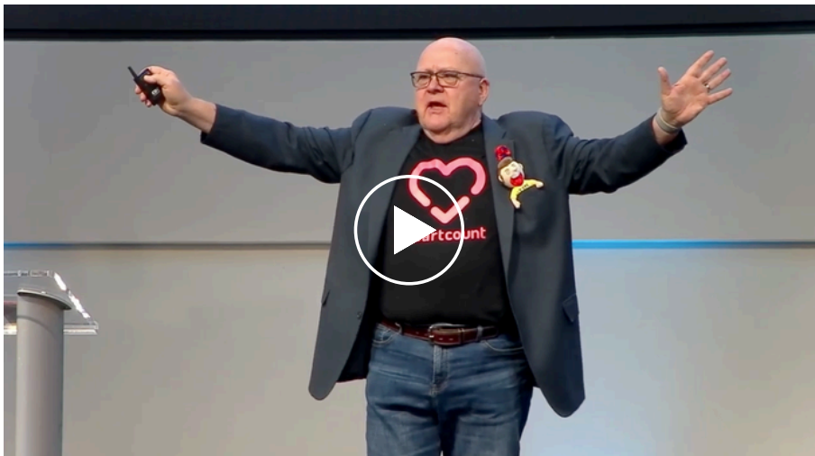
"It's Your Choice." Garry Ridge speaks at Purpose Summit 2024 in Charlotte.